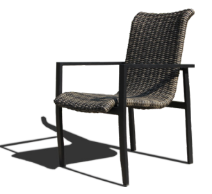
ESM-3474-DC Dining Chair 24"W x 30"D x 37.5"H

ESM-3474-RDT Round Dining Table w/ Laser Etched Top and Umbrella Hole 50" Dia x 29.5" H