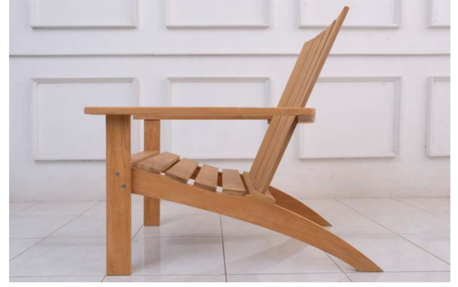
WML-2201-ADR-C Solid Teak Adirondack Chair 27"W x 37" D x 38"H