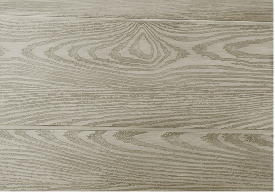
TABLETOP ETCHING DETAIL