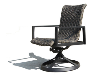
ESM-3474-SRDC Swivel Rocking Dining Chair 24"W x 30"D x 37.5"H