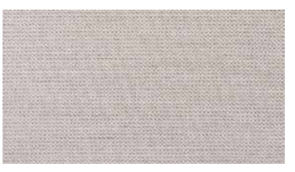
VALOR PUTTY CUSHIONS