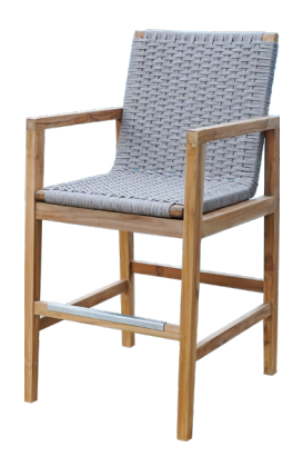
WML-2206-CHC Counter Height Chair W 22.5" D 21" H 43.5"

WML-2206-CHT42RD 42" Round Counter Table 42" Round 36" High