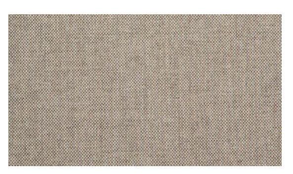
IDOL SHALE CUSHIONS