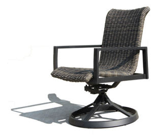
EMS3474TRB - SRDC Swivel Rocker 24" W x 30" H x 37.5" H