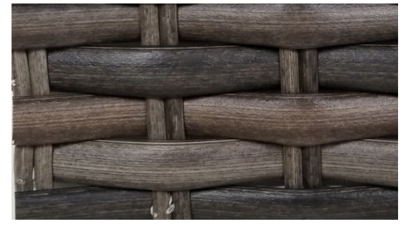
SILVER OAK FINISH